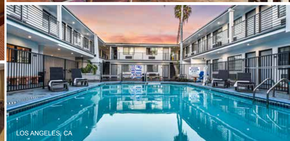
LOS ANGELES, CA